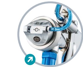
Robust stainless steel air head