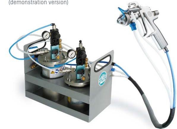
⊕ PILOT Klebond 2K package (demonstration version)

All internal material parts are stainless steel (rust-free). The cleaning of the wear parts is thus easy to implement. Alongside flexible functionality, we place value on an attractive optic.